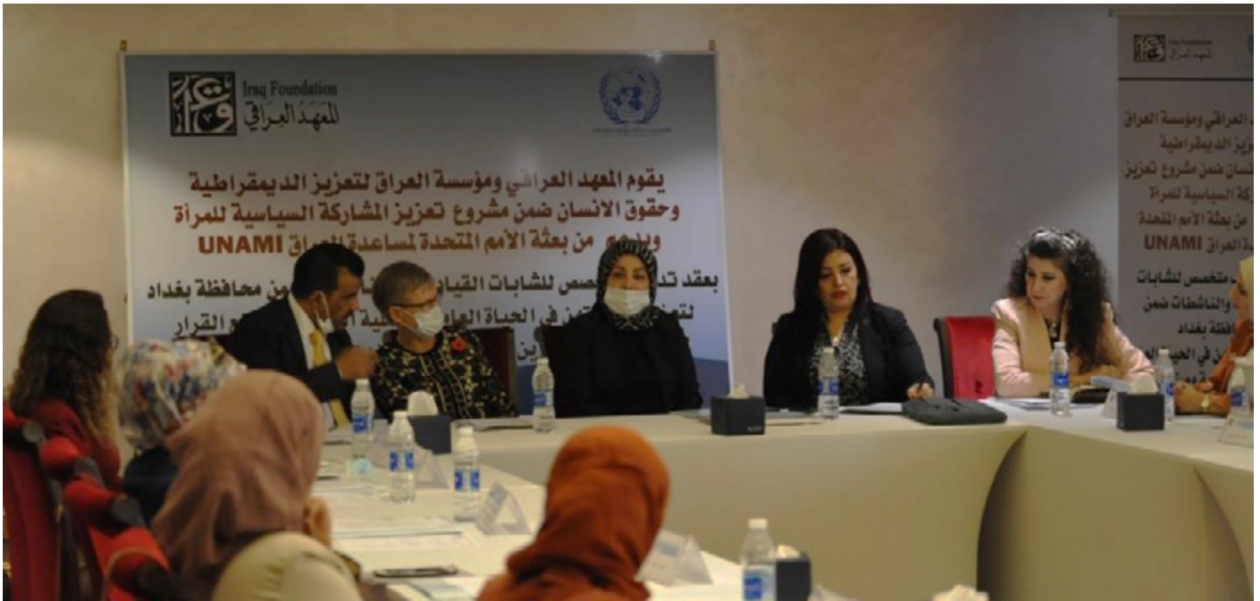
Baghdad, 4 November 2020, training for women intending to enter public office

political frameworks that control the State and its resources. In their view, such parties inevitably exclude women, considering them mere election tools instead of political actors. A second group of women activists opposed this view, and stressed the continuous need for parties, since they remained the most prominent political domains. However, they highlighted the need for a new understanding of parties' roles, and to develop their structures and forms. They believe that the latest protests will change the position and status of women in the general political scene in the upcoming years, but insufficiently. In their opinion, there is a need to build on these results by establishing a political feminist leadership that is active, influential and truly representative of people's causes, including those of women.